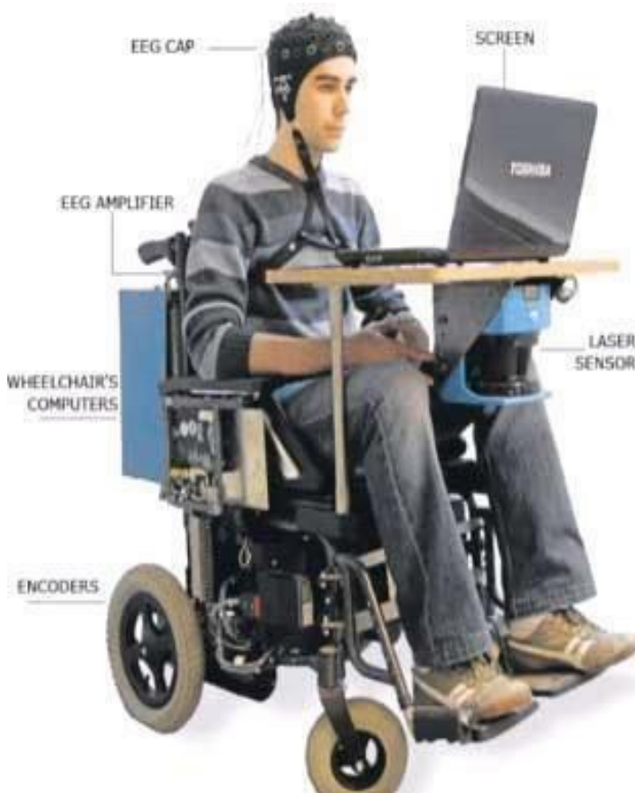
Figure 2.BCI control of wheelchair

Mobile robot technology and its application in various sector is currently an area of high interest. The variety of service robots were designed to operate in populated environments which facilitate safe, reliable and effective operation of mobile robots and execution of assigned task. In order to navigate safely and reliably, mobile robot must be able to create suitable representation of environment. Telepresence could be seen as an extension of the sensorial functions of daily life by means of physical device, embodied in the real environment and placed anywhere in the world could perceive, explore, manipulate, and interact with the remote scenario, and controlled only by brain activity. The important requirement for the telepresence system is to provide the safe interaction of the mobile robot with the remote environment, so the key point from mobile robot is to accurately detect the obstacles and provide the awareness to the user.