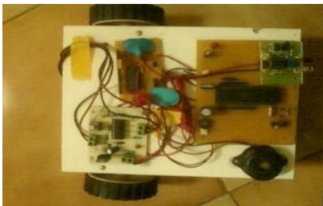
Figure 3.Robotic station

Our Telepresence mobile robot consist of wheels, RF-receiver, motor drivers, AT89S52 and the robot is equipped with the Infrared sensor capable of detecting the obstacles and for the navigation connected the two gear motors which keeps the full control of wheelchair, one gear motor is used to move forward and backward directions while other one is used to turn the wheelchair towards left and left positions.