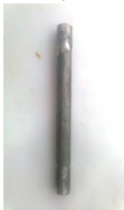
Fig 2.Fabricated work piece

Wear studies of the composites leads to following discussions. Sample size was 240mm length and 20mm dia. fabricated work pieces are shown in Fig 2.