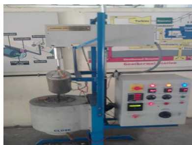
Fig.1 Experimental setup used for stir casting

The composites were fabricated by stir casting method to ensure uniform distribution of the reinforcements. The LM 25 alloy, initially in the form of ingot, which was cut into small pieces then it is placed in the Teflon coated crucible, Aluminum alloy was first melted in an electric furnace. flyash and B 4 C, pre heated to a temperature of about 600°C, were added to the molten metal at 850°C and stirred continuously. The stirring was carried out at 60rpm for 10min. Then the preheated reinforcement was poured into a permanent metallic mold. Casting setup is presented in Fig.1