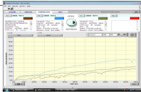
Fig.3 Wear rate graph for 5% of Reinforcement

The above graph shows that the percentage of reinforcement B 4 C and fly ash increases there is reduction in the percentage of weight loss of the composite material in pin on disc wear tester. The wear resistance increases with the increases in the weight percentage of the reinforcement.