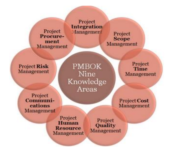
Figure.1 PMBOK's Nine Knowledge Areas

within the project management discipline. Project Management is "the application of knowledge, skills, tools and techniques to project activities in order to meet or exceed needs and stakeholder expectations from a project".