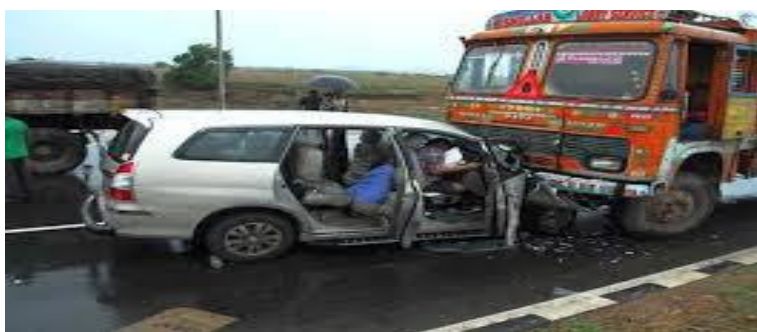
Fig1-A severe accident on NH5