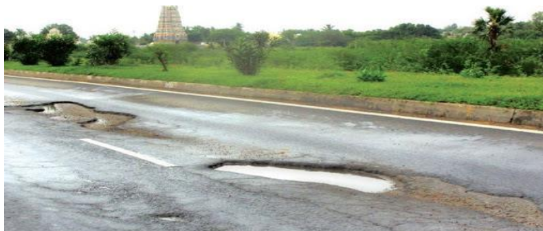
Fig 2: Potholes on highways